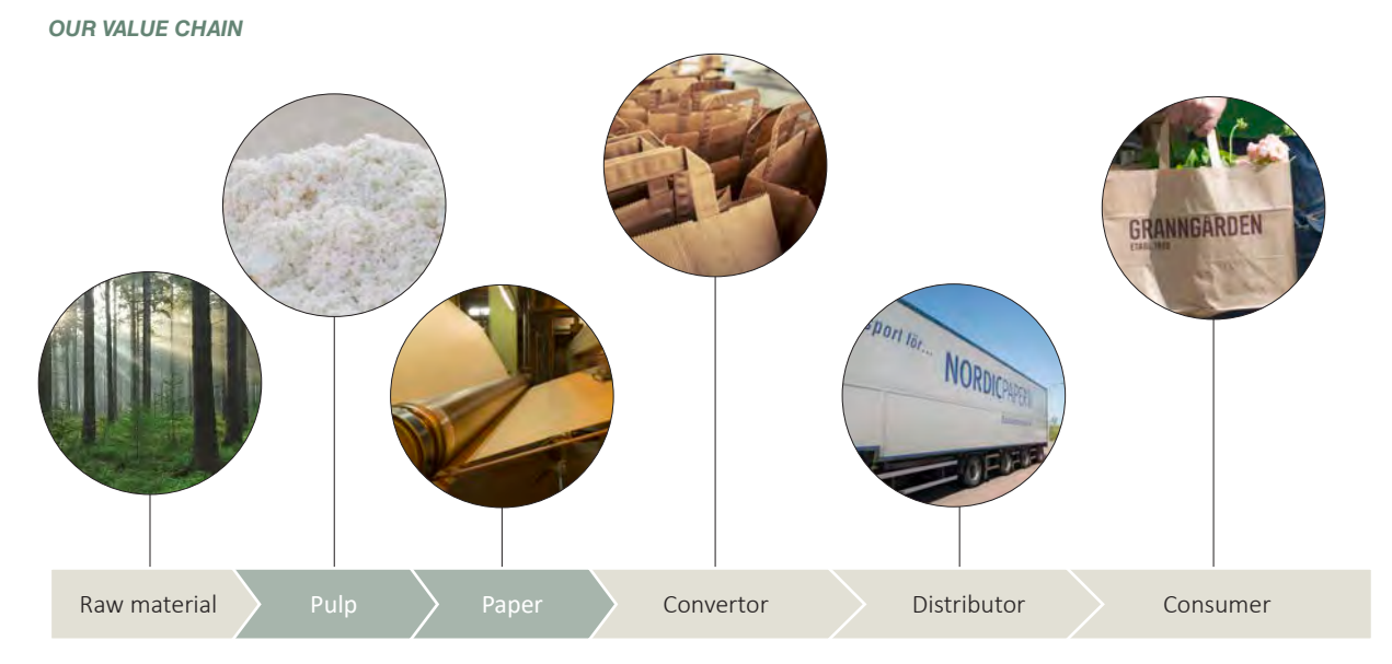
Nordic Paper manufactures and sells pulp and paper. Our value chain extends beyond that: our paper is used by people all over the world, every day. We work actively to ensure that our paper is a sustainable product throughout its lifecycle.

We work with suppliers who have operations located as close to our units as possible: the majority, more than 95 per cent in total, are therefore Scandinavian (primarily in Sweden and Norway).